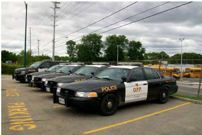
Ford’s Talbotville Assembly plant near St. Thomas produced the Crown Victoria until 2011. The 622-acre parcel is expected to be the site of an Amazon fulfillment centre.

The former Ford Talbotville assembly plant near St. Thomas will host an Amazon distribution warehouse in the near future. It is concerning that a world-class vehicle assembly plant that was once the sole source of the Crown Victoria - ubiquitous among North America’s police departments - will become a distribution centre for imported products while manufacturers struggle to find suitable space.