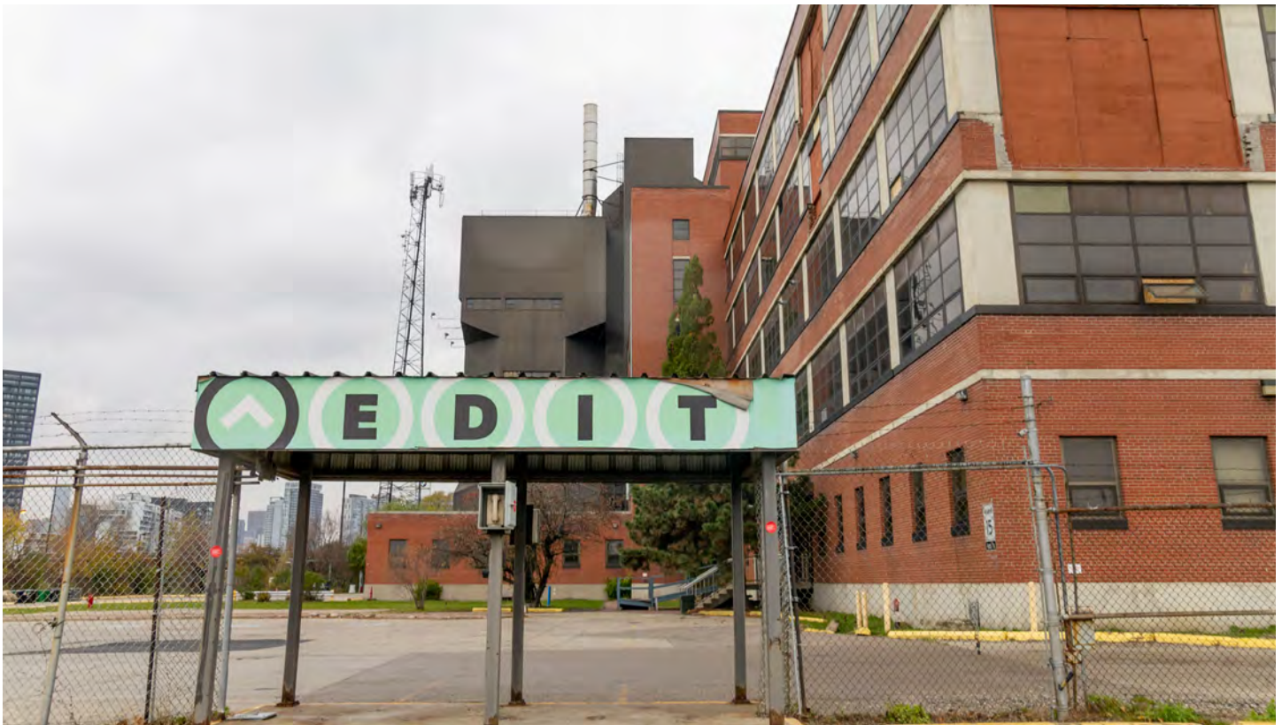
The former Lever Ponds 38-acre site in Toronto awaits development.

The products manufactured in Ontario factories are essential to our well-being in the best of times, and even more so during crises.