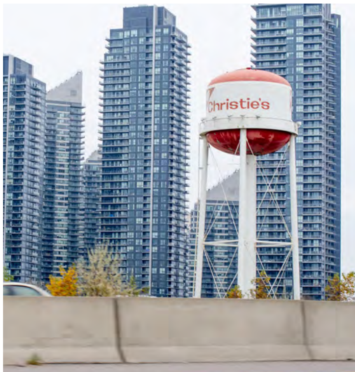
The iconic water tower is all that remains of the Christie cookie factory in Toronto.

Support upgrades and retrofitting where a return on investment from manufacturing is likely. In some cases, a suitable building or parcel of land exists, but upgrades to pipes, foundations, structure, or infrastructure are necessary. In the event that these are the most significant hurdles to an otherwise valuable manufacturing investment, governments at all levels may consider providing support for upgrades. In instances where the manufacturer does not own the building, repayable contributions provided to the building's owner that are tied to rent payments or property tax incentives over several years may be the most appropriate.